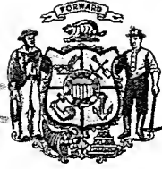
EXHIBIT 313 05 CF 381 DATE 03-23-07 JB Initials

RECEIVED APR 04 2006 CALUMET COUNTY SHERIFF CHILTON, WI